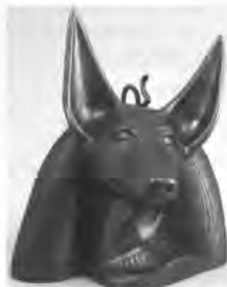
Title: Anubis Artist: Jack Thompson Medium: Painted ceramic Copyright © 2003 Jack Thompson

Thanks to the growing trend in cool customized burial containers, your corpse can now spend eternity in anything from a